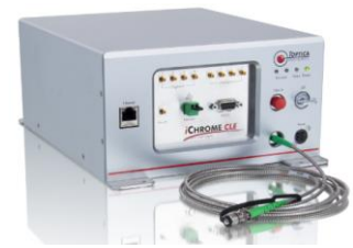
The 4-color laser engine iChrome CLE is cost-effective and ideal for confocal microscopy.

The new multi-laser engine iChrome CLE for biophotonics provides light at 405, 488, 561 and 640 nm with 20 mW each. It is the cost-effective system of choice for multi-color microscopy applications due to its compact design and economic operation. Since the 561 nm light is generated by a laser diode instead of solid state laser, this system can be directly modulated at high speed (1 MHz) while maintaining complete-off in the dark state. The iChrome CLE is the latest member of TOPTICA's iChrome product line which also includes the power-champion iChrome MLE (up to 100 mW at four individual laser lines). All iChrome systems have a unified user interface, unique modulation features and COOL AC , TOPTICA's proprietary and fully automated beam alignment algorithm.