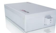
The TopWave 266 provides 150 mW at 266 nm with extended lifetime.