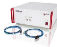
Non-destructive testing is possible with TOPTICA's time-domain terahertz platform TeraFlash.

Contact-free material characterization techniques with unprecedented data rates are now possible thanks to TOPTICA's new TeraSpeed . This superfast terahertz sensing platform supports applications like non-destructive testing , plastic inspection or process control with a sampling rate of 100 million data points per second. The TeraSpeed complements TOPTICA's unique portfolio of terahertz systems. The product range also includes the time-domain terahertz platform TeraFlash , which achieves an unsurpassed peak dynamic range of 90 dB and a bandwidth of 6 THz. In addition, the frequency-domain terahertz platform TeraScan allows for a frequency resolution better than 10 MHz and a dynamic range up to 100 dB.