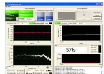
The user-friendly graphical user interface of the PLL option enables the user to control and monitor the synchronisation.