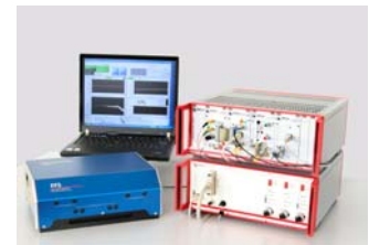
FemtoFiber scientific laser with PLL-synchronisation electronics and graphical user interface on laptop computer.

The FemtoFiber laser has powerful outputs at 775 and 1550 nm and pulse durations of 100 fs and below. Further options include wavelength-tunable