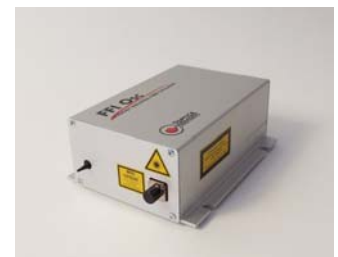
FFI Osc – Ytterbium or Erbium based ultrafast lasers with average powers up to 50 mW

Laser output is either provided via single-mode fiber (default for Ytterbium